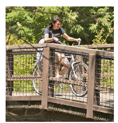
UC Davis is known as the "bike capital" of the United States.