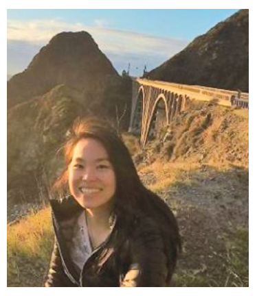
"The Global Study Program events are awesome and a very good opportunity to interact with other students and GSP staff."

STUDENTS RECOMMENDING PROGRAM TO FRIENDS: <u>100 PERCENT</u>